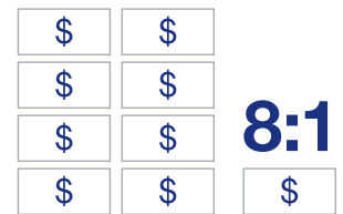
Wealth gap between white and Black families. 1

Black households hold significantly less wealth than white households.